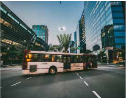
Transport and conveyance