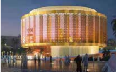
Project: Flexible LED curtain for EXPO 2020

Benefit: Material also available in cartridges