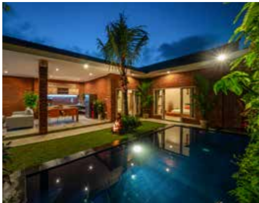
Use at home