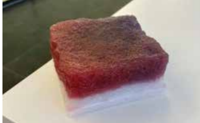
Project: LED paving stone

Benefit: Very high transparency due to high transmission values