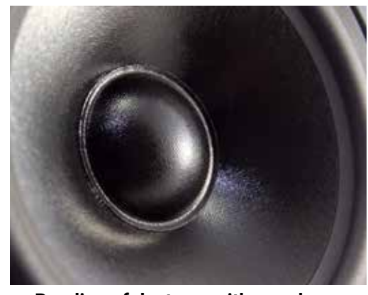
Bonding of dust cap with membrane