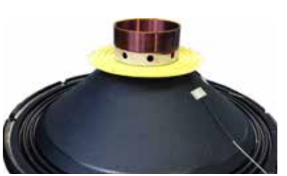
Project: Bonding of damping with voice coil and membrane

Benefit: Mixing ratio 1:1 - safe for automatic dosing