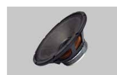
Project: Bonding of rubber gasket

Benefit: 30 % gain in time by fast strength build-up after pot life