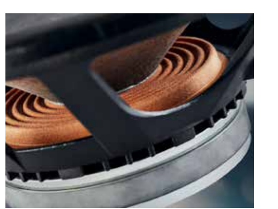
Bonding of pole plate, ferrite ring, front plate and basket