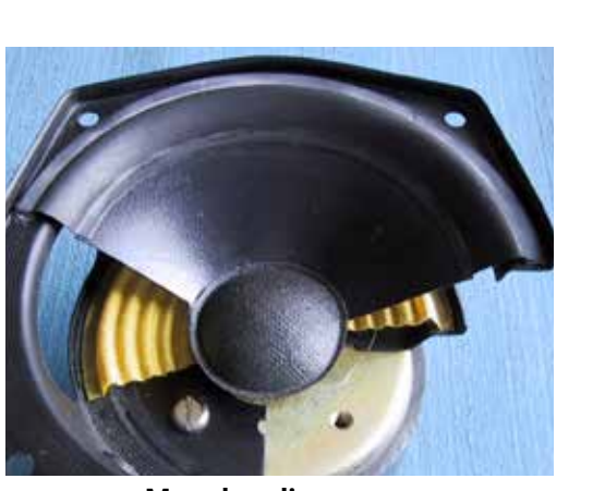
More bonding areas